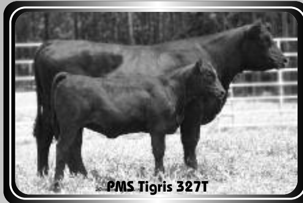
PMS Tigris 327T

EPDs: What an attractive pair of cattle. 327T is another of these great Power Surge daughters and is out of our tremendous producing donor Elizabeth. If you have a junior looking for a Spring born heifer calf that is fancy, correct and has good show potential, her Basie calf at side will fit the bill. Pasture exposed 1/15/11 to 5/11/11 to ANDJ Glamours Dream. Pasture exposed 5/12/11 to 8/17/11 to PMS Lookin Good 498X. CE 7 BW 2 WW 40 YW 66 MCE 4 MM -6 MWW 14 STAY 21 CW 4 YG .03 MARB .04 BF .02 REA .1 API 105 TI 62