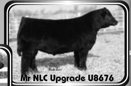
Mr NLC Upgrade U8676