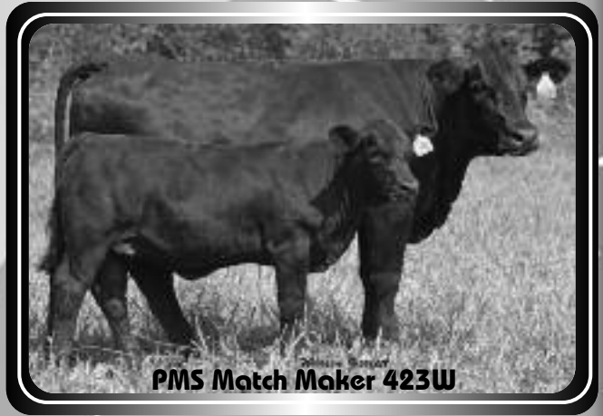
PMS Match Maker 423W