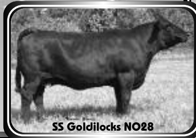
SS Goldilocks NO28

The dam of these embryos, SS Goldilocks is one whale of a cow. Super big middled, thick ended and big boned, she also has an exceptional amount of eye appeal and balance. Mr NLC Upgrade is certainly one of the hottest bulls in the Simmental breed at this time. Calves from this mating should be extremely attractive and powerful. The 78+ pound birth to yearling EPD will just be icing on the cake. THSF Freedom continues to amaze us with his ability to produce stout and attractive cattle every time. We believe these calves out of Goldilocks will be exceptional in every way. Guaranteeing 1 pregnancy from each of these matings if the work is done by an AETA certified embryologist. Guaranteeing a minimum of 3 pregnancies if both sets of embryos are purchased by the same buyer and the work is done by an AETA certified embryologist.