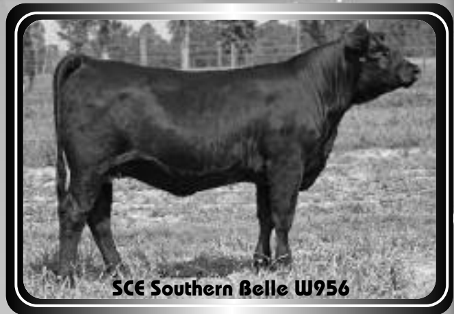
SCE Southern Belle W956