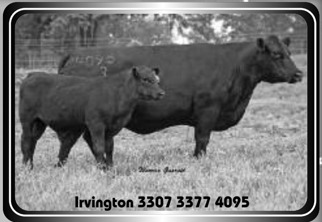
Irvington 3307 3377 4095