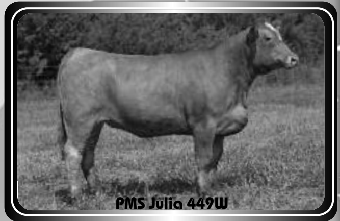
PMS Julia 449W