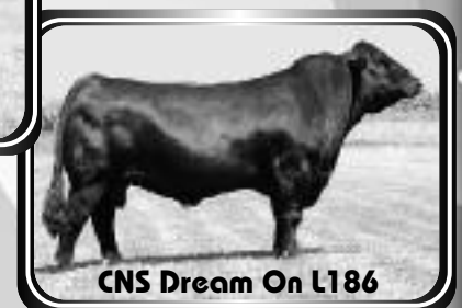
CNS Dream On L186