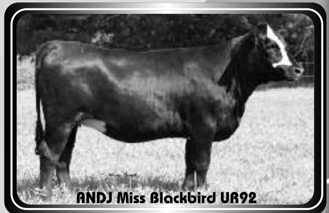
ANDJ Miss Blackbird UR92

We purchased UR92 as one of the high selling lots in the 2010 Southern Showcase. UR92 has continued to get better every day and has exceeded our high expectations. She has done a fantastic job with her second generation 1/2 blood calf sired by Rookie and has a near perfect udder. Here is an opportunity to sample our most cutting edge 1/2 blood genetics. Buyer will be responsible for embryo transfer fees, semen, freezing and shipping of embryos. Guaranteeing a minimum of 6 grade 1 embryos with no top.