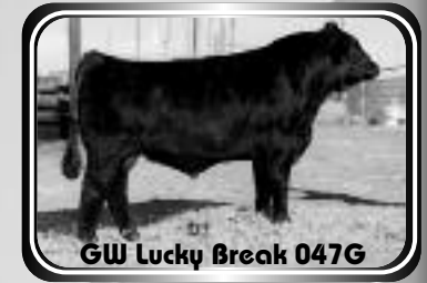
GW Lucky Break 047G