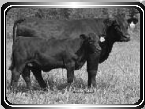
PMS Match Maker 423W