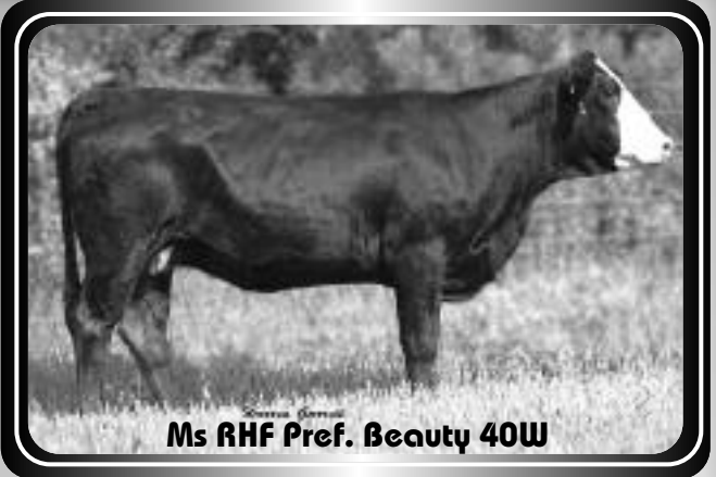
Ms RHF Pref. Beauty 40W