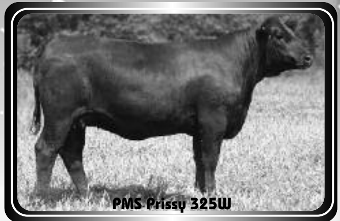
PMS Prissy 325W