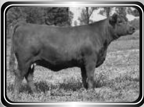
SCE Hot N Spicy W971