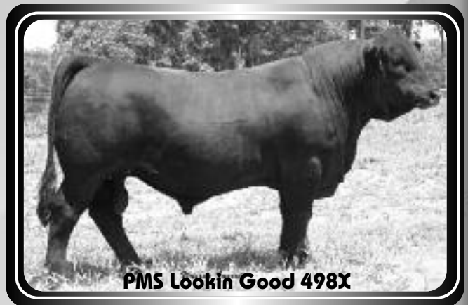
PMS Lookin Good 498X