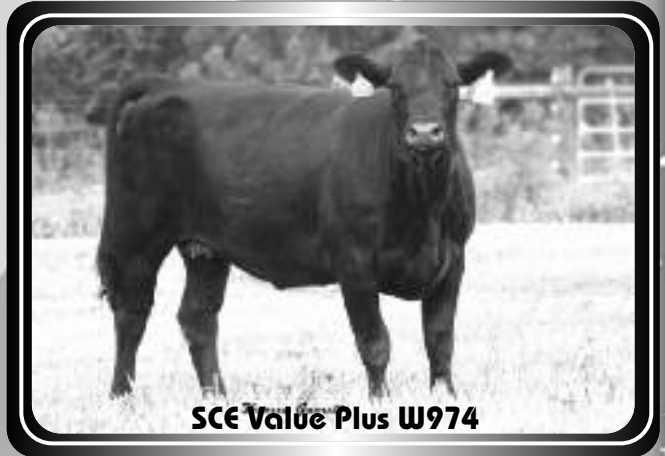
SCE Value Plus W974

W974 is a full sister to the females selling as lot 50 and 51. Another Preferred Beef x Ella female, she is well balanced, feminine and neat in her design. These full sisters would make an impact on anyone's breeding program for years to come. AI bred 4/8/11 to Mr NLC Upgrade U8676. Pasture exposed 5/10/11 to 6/13/11 to SCE Red Hot W975.