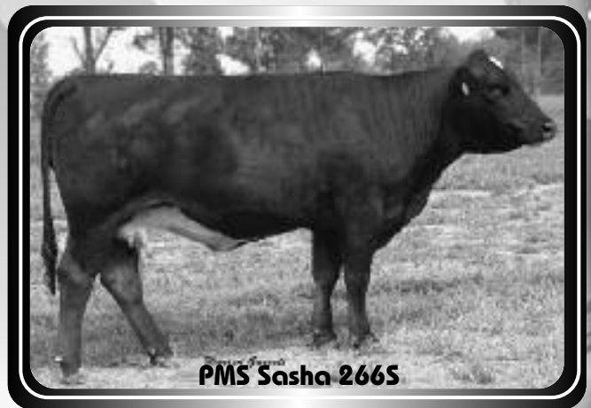
PMS Sasha 2665