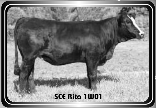
SCE Rita 1W01