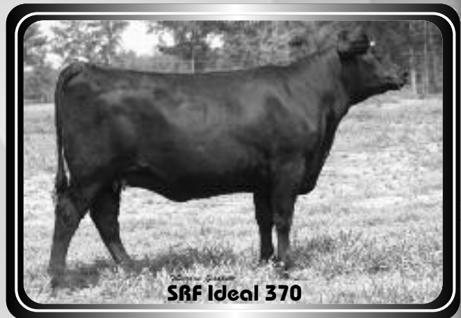
SRF Ideal 370