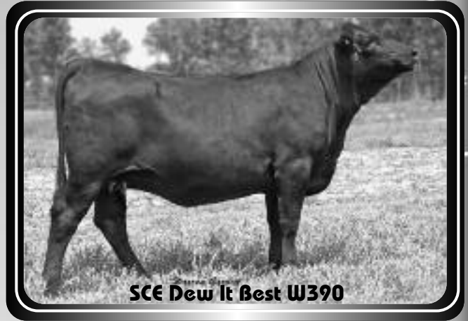
SCE Dew It Best W390