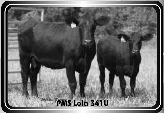
PMS Lola 341U

341U is an ET daughter of Gambler out of our former donor STF Rising Storm. This good young cow has shown what she can produce with this tremendous Ranch Hand heifer calf at side. Pairs like this will get your attention. Pasture exposed 1/15/11 to 5/11/11 to ANDJ Glamours Dream. Pasture exposed 5/12/11 to 8/17/11 to PMS Lookin Good 498X.