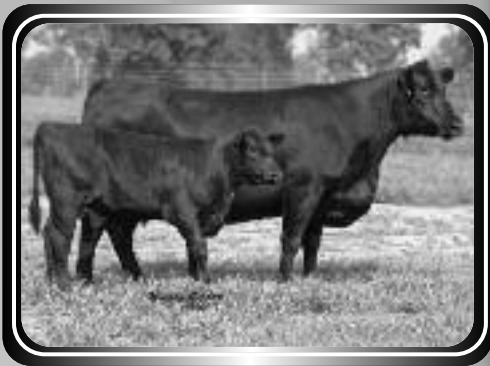
Lemmon Jilt S109