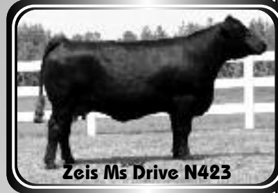
Zeis Ms Drive N423