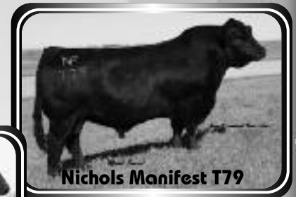
Nichols Manifest T79