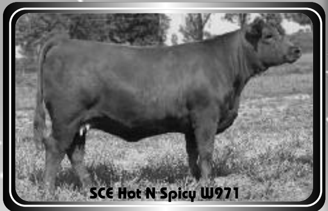
SCE Hot N Spicy W971