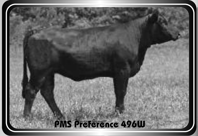
PMS Preference 496W