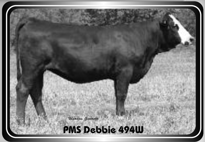
PMS Debbie 494W