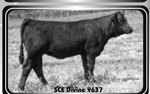
SCE Divine Y637