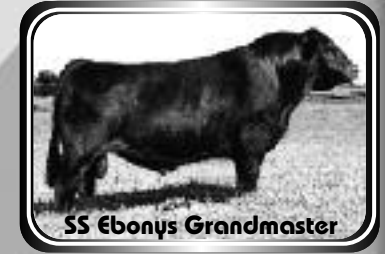
SS Ebonys Grandmaster