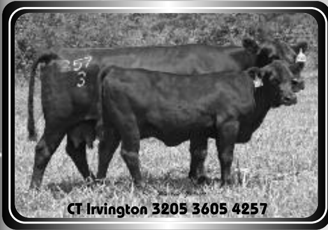
CT Irvington 3205 3605 4257