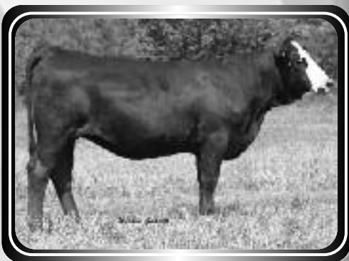
PMS Debbie 494W

Offering 62 Lots of Simmental, Simbrah, SimAngus & Angus