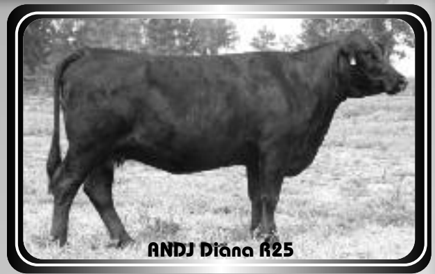
ANDJ Diana R25