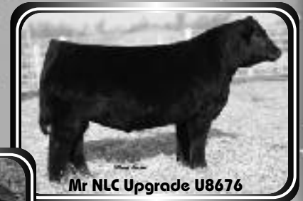
Mr NLC Upgrade U8676