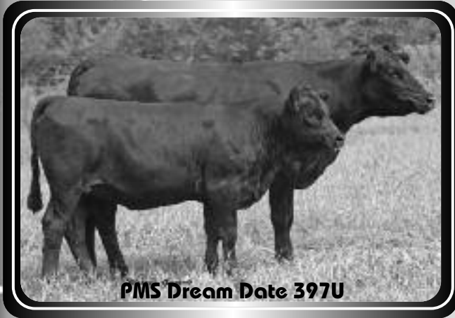
PMS Dream Date 397U