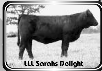
LLL Sarahs Delight