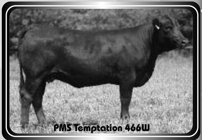
PMS Temptation 466W