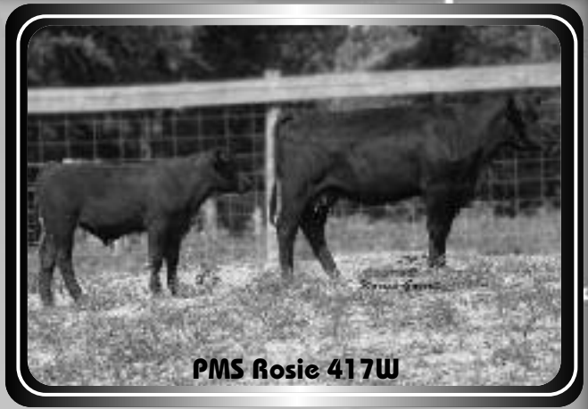
PMS Rosie 417W

417W is a nice young Dream On daughter that is moderate and neat and clean in her design. Her bull calf by Ranch Hand has good enough calving ease and birth weight EPD's for your bull customers to use on heifers. Pasture exposed 1/15/11 to 5/11/11 to PMS Armstrong 412U. Pasture exposed 5/12/11 to 8/17/11 to PMS Lookin Good 498X.