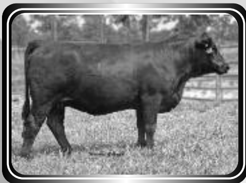
SCE Queen High W977