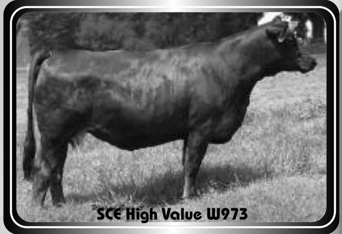
SCE High Value W973

If you want to make a lasting mark on your breeding program, try to put these 3 full sisters, lot 50, 51 and 52 together to add to your program. W973 is a feminine fronted, square hipped, well balanced female and is very deep sided and broody. These Preferred Beef x Ellas will make some awesome cows. AI bred 1/10/11 to Nichols Manifest T79. Pasture exposed 1/25/11 to 2/23/11 to ANDJ Mr Adrian W305. Due mid-November to ANDJ Mr Adrian W305.