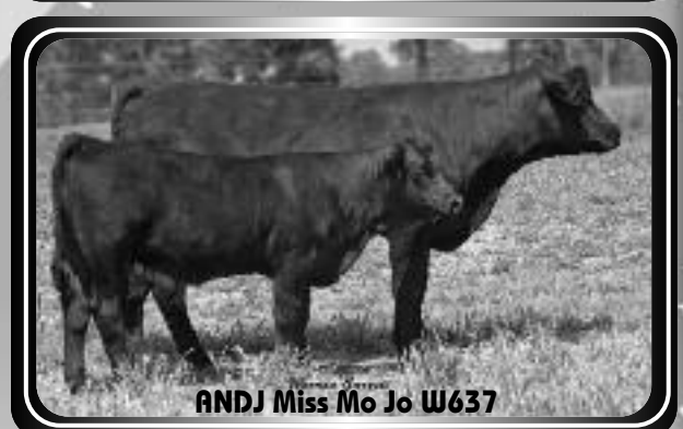
ANDJ Miss Mo Jo W637