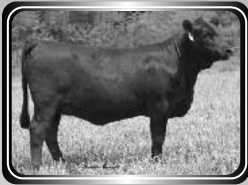
3J Miss Fatty