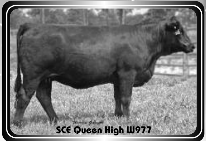
SCE Queen High W977

It's not very many sale offerings you can look through and find 5 Preferred Beef ET daughters in a row in the catalog. I am offering a top set of females here which I am sure you will take note of on sale day. Out of my consistently good producing donor, N302, W977 is a soft middle, moderate, well balanced, easy fleshing brood cow deluxe. The real cowboys won't have any trouble finding this one. Full sister to lot 54. AI bred 12/14/10 to THSF Freedom 300N. Pasture exposed 1/25/11 to 2/23/11 to ANDJ Mr Adrian W305. Due 9/24/11 to THSF Freedom 300N.