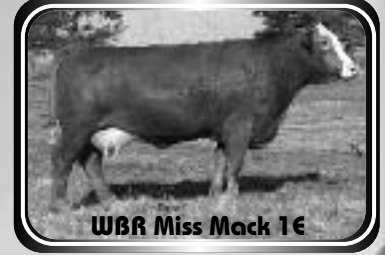
WBR Miss Mack 1E