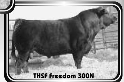
THSF Freedom 300N

OWNER: Poe Farms, Dallas, GA Co-owned with J & J Cattle Co.