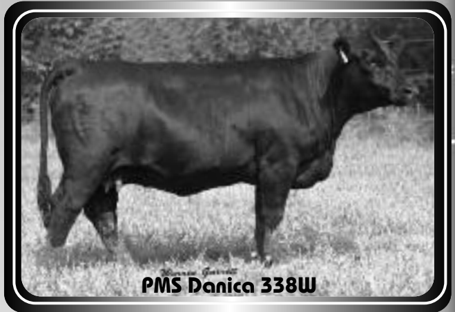
PMS Danica 338W