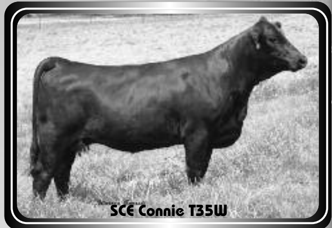
SCE Connie T35W