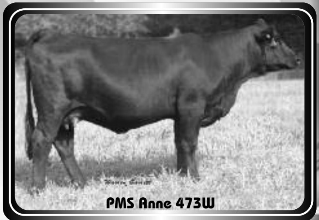
PMS Anne 473W