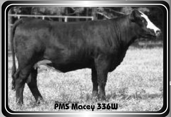
PMS Macey 336W