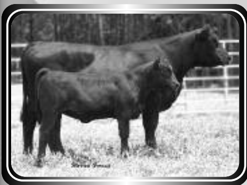
PMS Tigris 327T