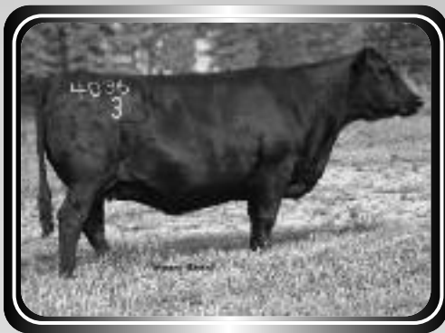
CT Irvington 3547 2720 4036