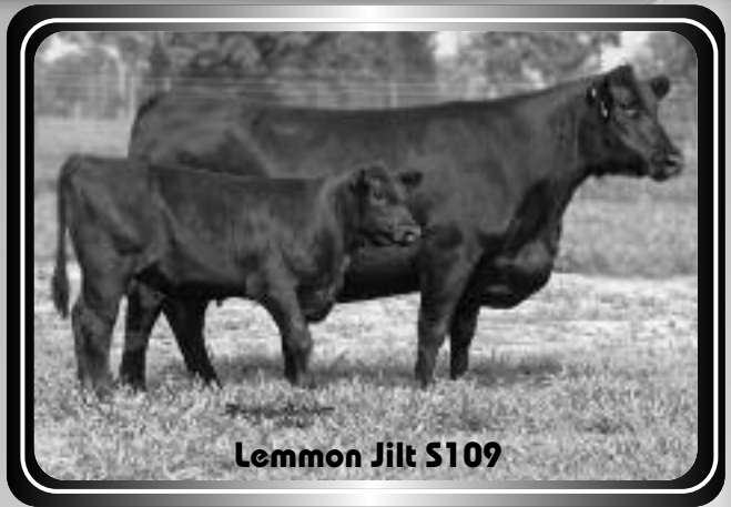
Lemmon Jilt S109

What a tremendous pair of cattle! This 004 daughter will have tons of friends on sale day. The fantastic heifer calf she brings at side will be absolute proof of what this female can do for you. Donor potential is through the roof here. AI bred 5/5/11 to THSF Freedom 300N. Pasture exposed 5/17/11 to 8/15/11 to Duff 55P Whopper 7129.