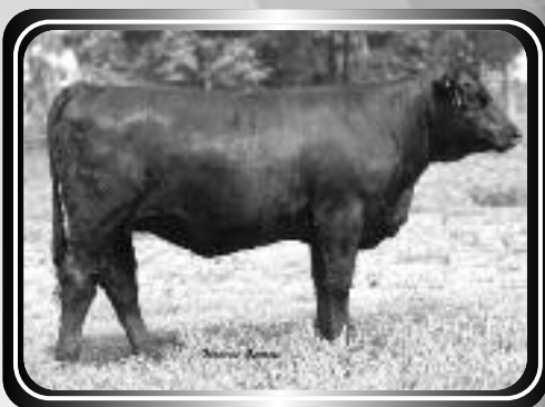
SCE Spade Flush W978