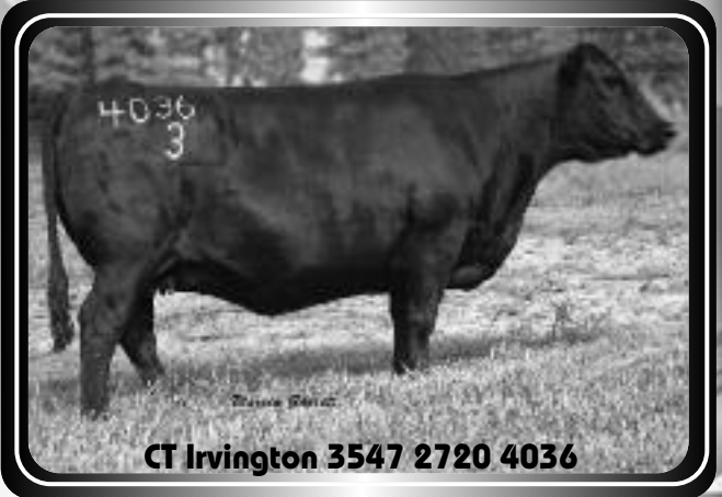
CT Irvington 3547 2720 4036