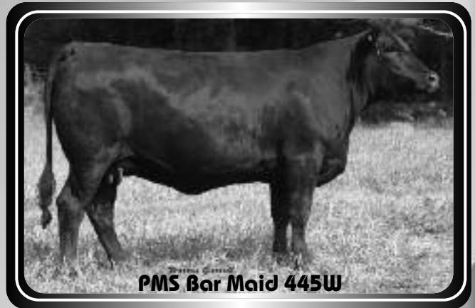
PMS Bar Maid 445W