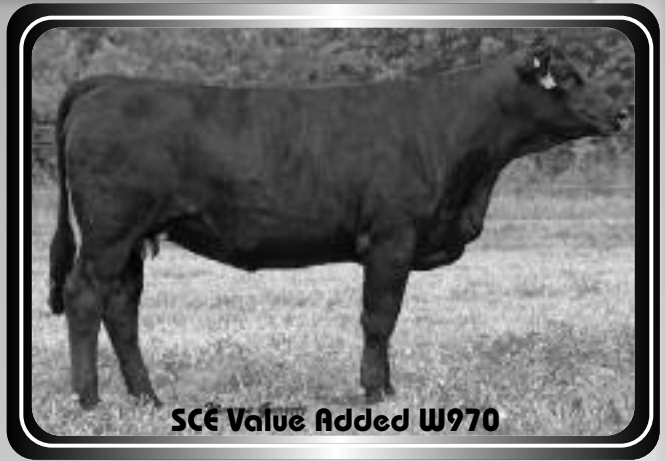
SCE Value Added W970

Pasture exposed 1/25/11 to 2/23/11 to ANDJ Mr Adrian W305. Due early to mid-November to ANDJ Mr Adrian W305.