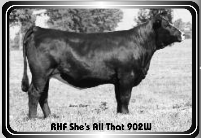
RHF She's All That 902W