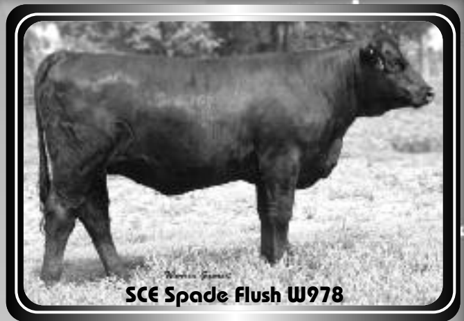
SCE Spade Flush W978