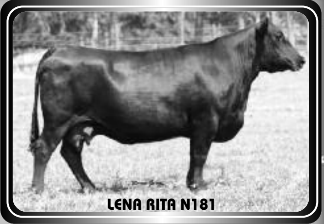
LENA RITA N181