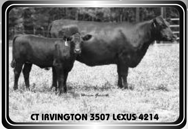
CT IRVINGTON 3507 LEXUS 4214

4214 is another good producing cow with a heifer calf at side. She is sired by the Ohlde bred bull Lexus. 4214 is a feminine, moderate, easy fleshing cow.