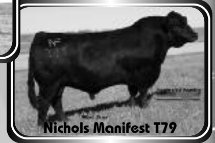
Nichols Manifest T79