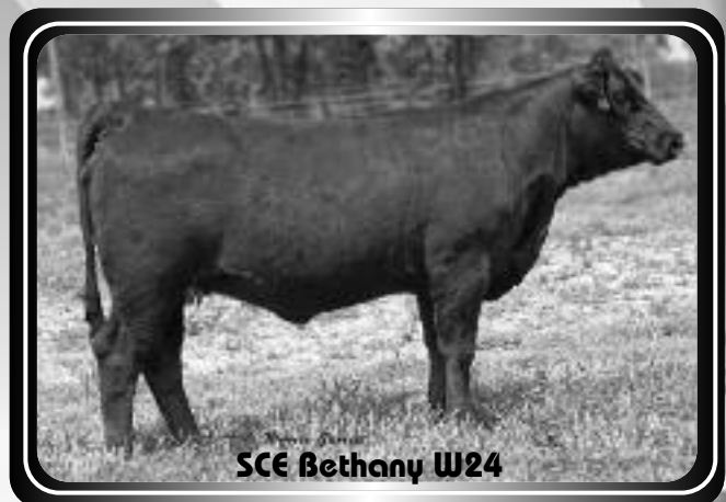
SCE Bethany W24