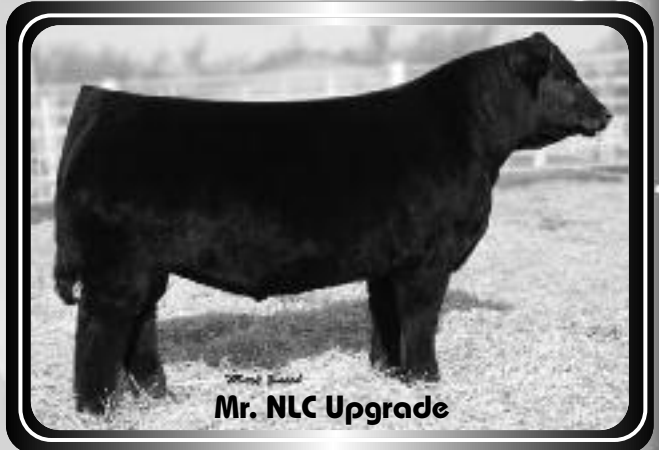
Mr. NLC Upgrade